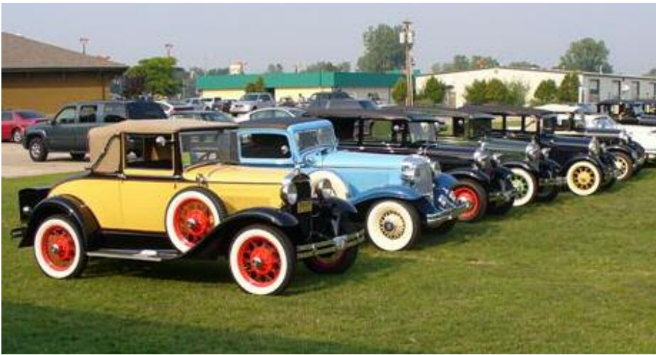
The Old Fort Model A Club always makes a stately showing at any GIAT event with their large number of finely restored/preserved classics.

Biomet highlighting their meticulous attention to detail in creating medical implants was first rate.