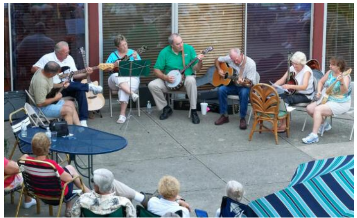
A GIAT tradition continues: the annual bluegrass concert thanks to our musically talented members.

The second stop of the day was the Workhorse Division of Navistar, also in Union City, to view their expert workers build motor home, truck, and bus chassis on the assembly line. Outfitted with a state-of-the-art, super clean work environment, GIAT got to see what it takes to put one of these babies together start-to-finish. The Workhorse staff deserved a round of applause for their hospitality.